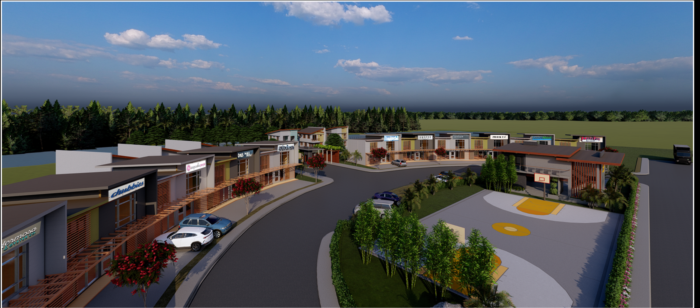
The Arcway center